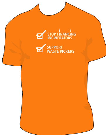
T-Shirts for COP17