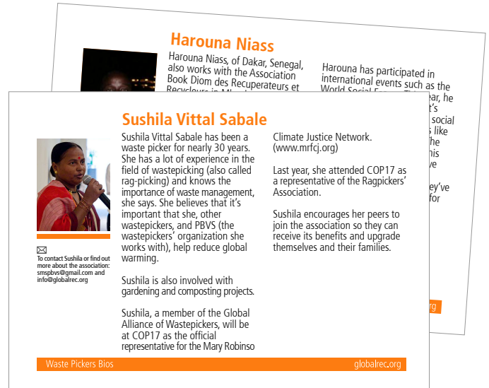
Waste Pickers biographies