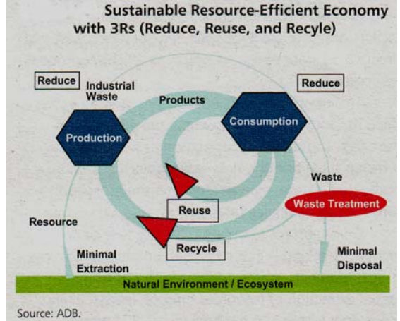
Figure 1.2 Sustainable Resource-Efficient Economy with 3Rs (Reduce, Reuse and Recycling)

Development and implementation of a national strategy for waste management is essential in order to reduce environmental, social and economical problems associated with the present disposal practices. In the past more attention had been given to waste disposal system as an end of the pipe solution with little attention to overall solid waste management. The proposed strategy is focused on the entire aspect of waste management from generation to final disposal site.